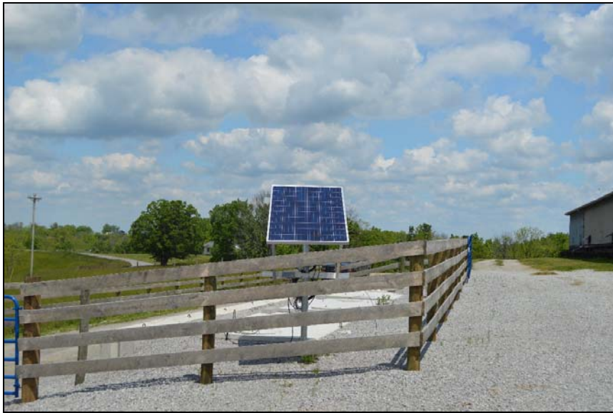
A solar powered pump installed in a water harvesting system.

Definition: The practice of using a solar panel and pump to distribute water within a water harvesting system. This practice includes the infrastructure necessary to direct, store, and distribute water. This practice is supported by NRCS practice standard codes 570: Stormwater Runoff Control , 614: Watering Facility , and 636: Water Harvesting Catchment . This practice is eligible for cost share through CAIP and EQIP in Kentucky.