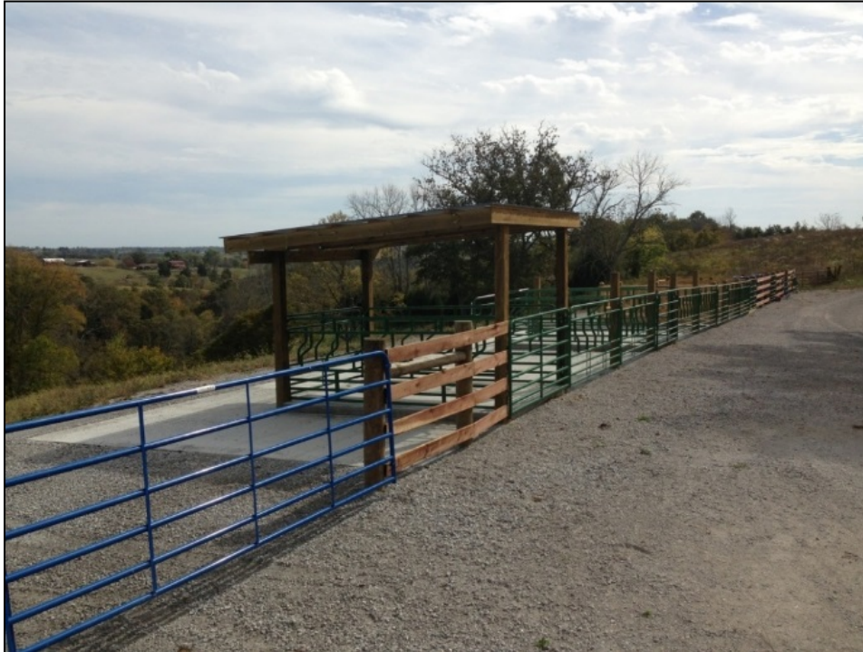
Fenceline Feeding System demonstration site at Eden Shale Farm

Definition: The practice of installing livestock feeding structures into strategically selected fencelines in close proximity to feedstuff storage facilities. This practice is supported by NRCS practice standard codes 382: Fence and 561: Heavy Use Area Protection . This practice is soon to be eligible for cost share through CAIP and EQIP in Kentucky.