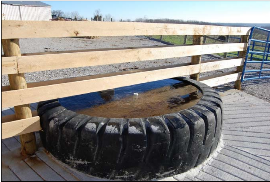
A tire tank waterer installed at Eden Shale Farm in northern Kentucky. The tire tank waterer is used to supply drinking water to cattle in two separate areas.

Definition: A livestock watering tank constructed from a repurposed heavy equipment tire. This practice is supported by NRCS practice standard codes 382: Fence , 561: Heavy Use Area Protection , and 614: Watering Facility . This practice is soon to be eligible for cost share through CAIP and EQIP in Kentucky.