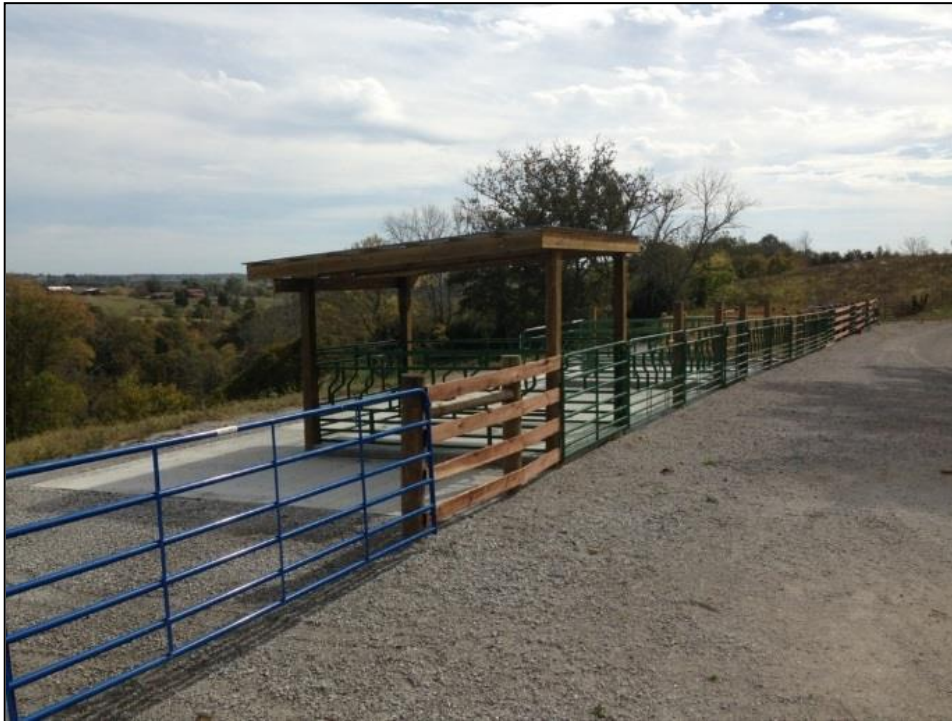
Fenceline Feeding System demonstration site at Eden Shale Farm

Definition: The practice of installing livestock feeding structures into strategically selected fencelines in close proximity to feedstuff storage facilities. This practice is supported by NRCS practice standard codes 382: Fence and 561: Heavy Use Area Protection. This practice is soon to be eligible for cost share through CAIP and EQIP in Kentucky.